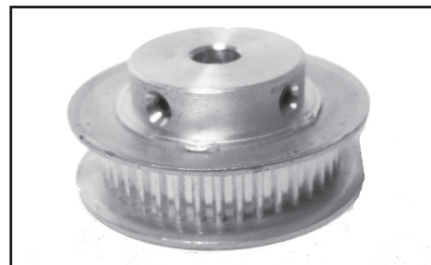
For T2.5 timing pulleys, see page 75.